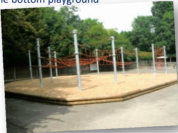
The climbing frame in the bottom playground