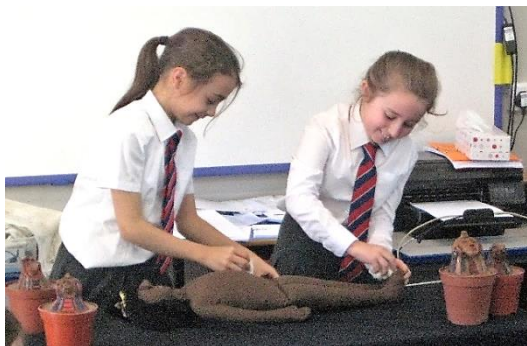
Year 3 pupils get to explore the contents of a Mummy at one of our Ancient Egyptian Workshops

You will be able to find out more about clubs at our Clubs Assembly at the beginning of each term.