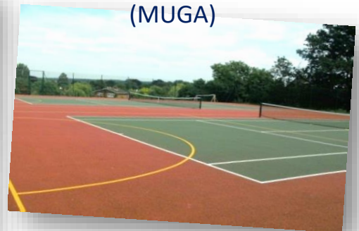
The Multi Use Games Area (MUGA)