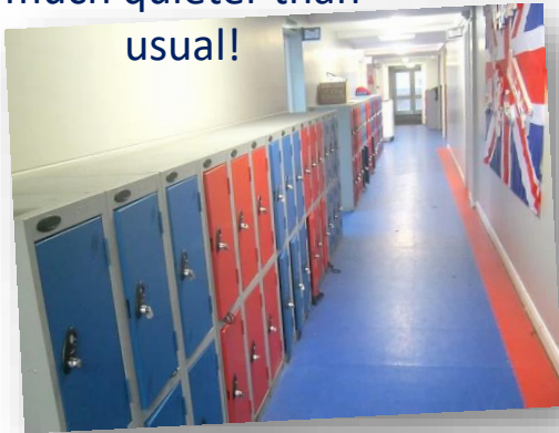
The main corridor— much quieter than usual!