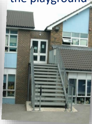
The bridge from the upstairs classrooms to the playground