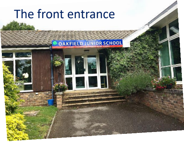
The front entrance