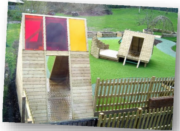
The Outdoor Learning Area