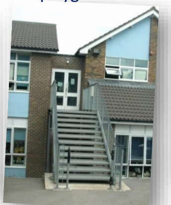
The creative cabin in the top playground