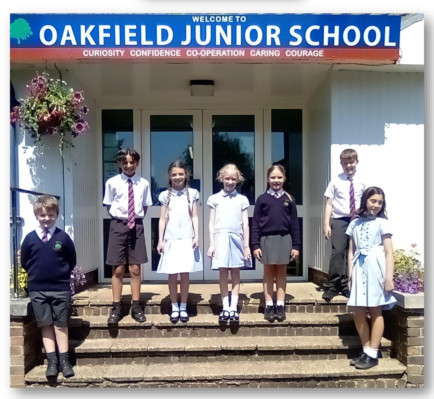
New Pupil Welcome Booklet 2023-24