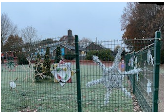
SNOWFLAKE DECORATION DISPLAY