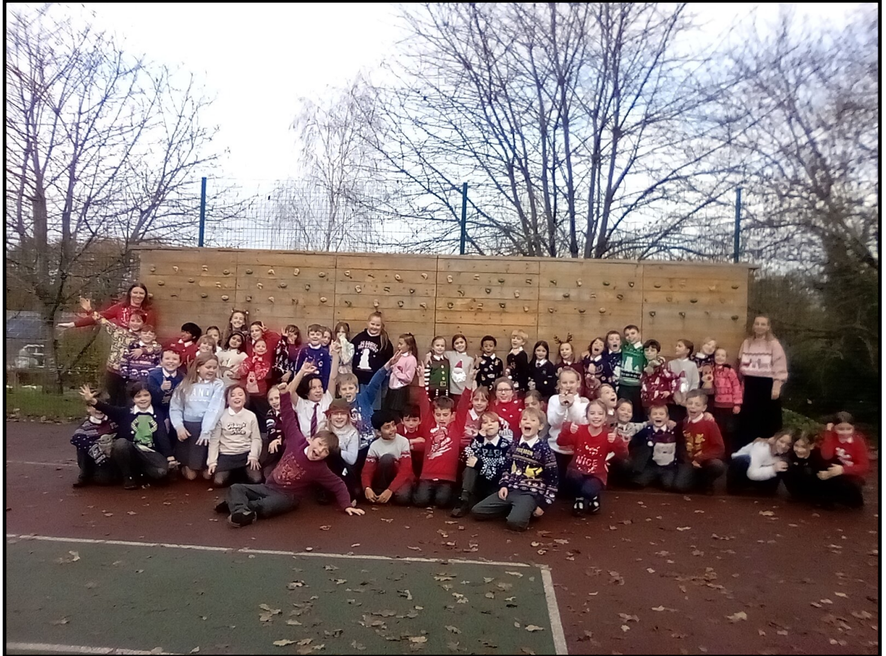
Year 4 enjoying Christmas jumper day!