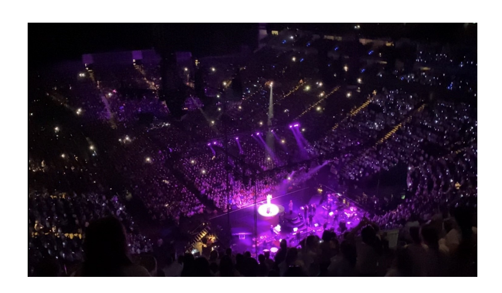
View of the stage

Excitement mounted... The magical moment arrived, the lights dimmed and the performance began. It was wonderful for choir to see and perform with Natalie Williams, MC Grammar, Urban Strides and also the incredible 13 year old drummer, Nandi Bushell. Children sang their hearts out, conducted themselves brilliantly and made all the adults very proud.